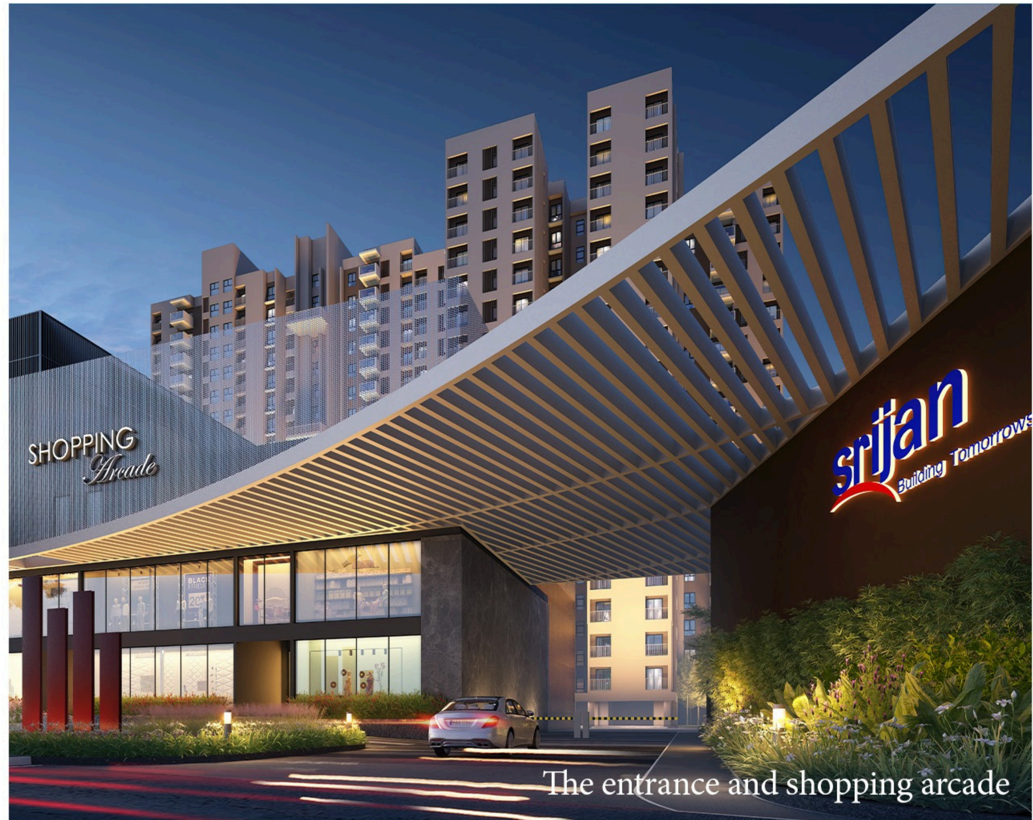
The entrance and shopping arcade

A in-house shuttle service to and from Sector V and New Town SEZ area will ensure a hassle-free daily commuting .