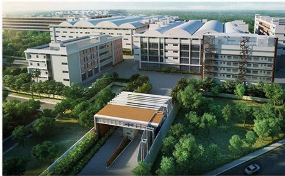
Srijan Industrial Logistic Park NH6