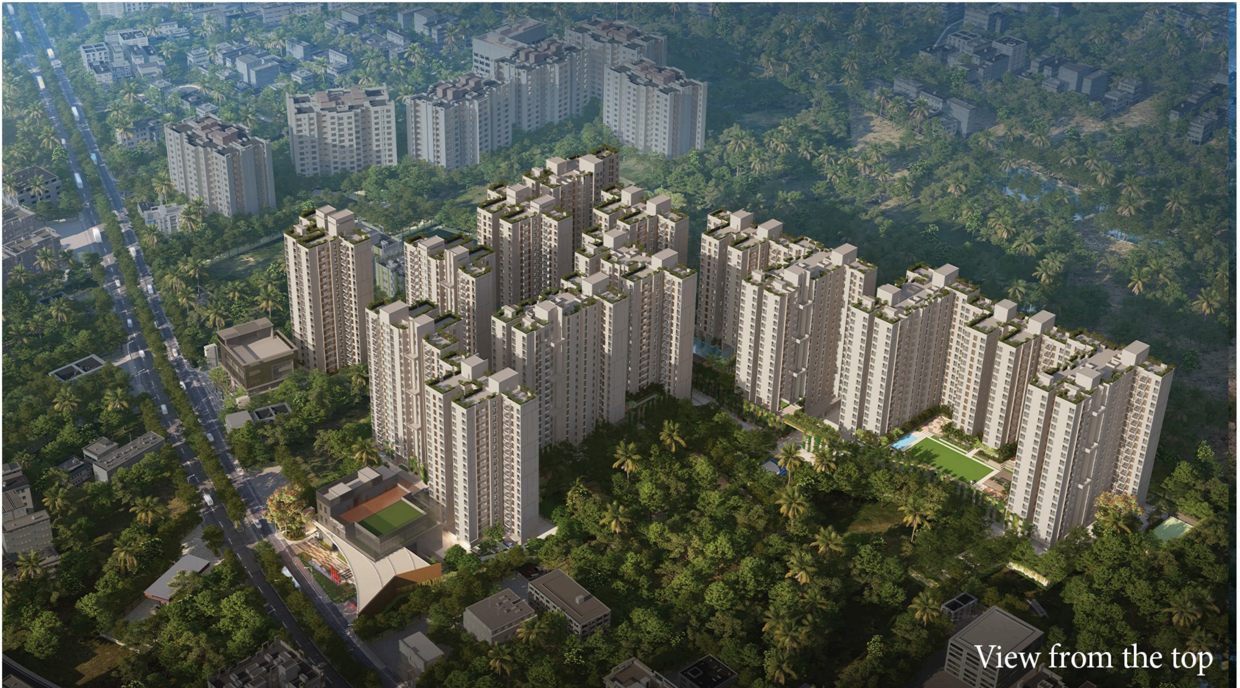
View from the top