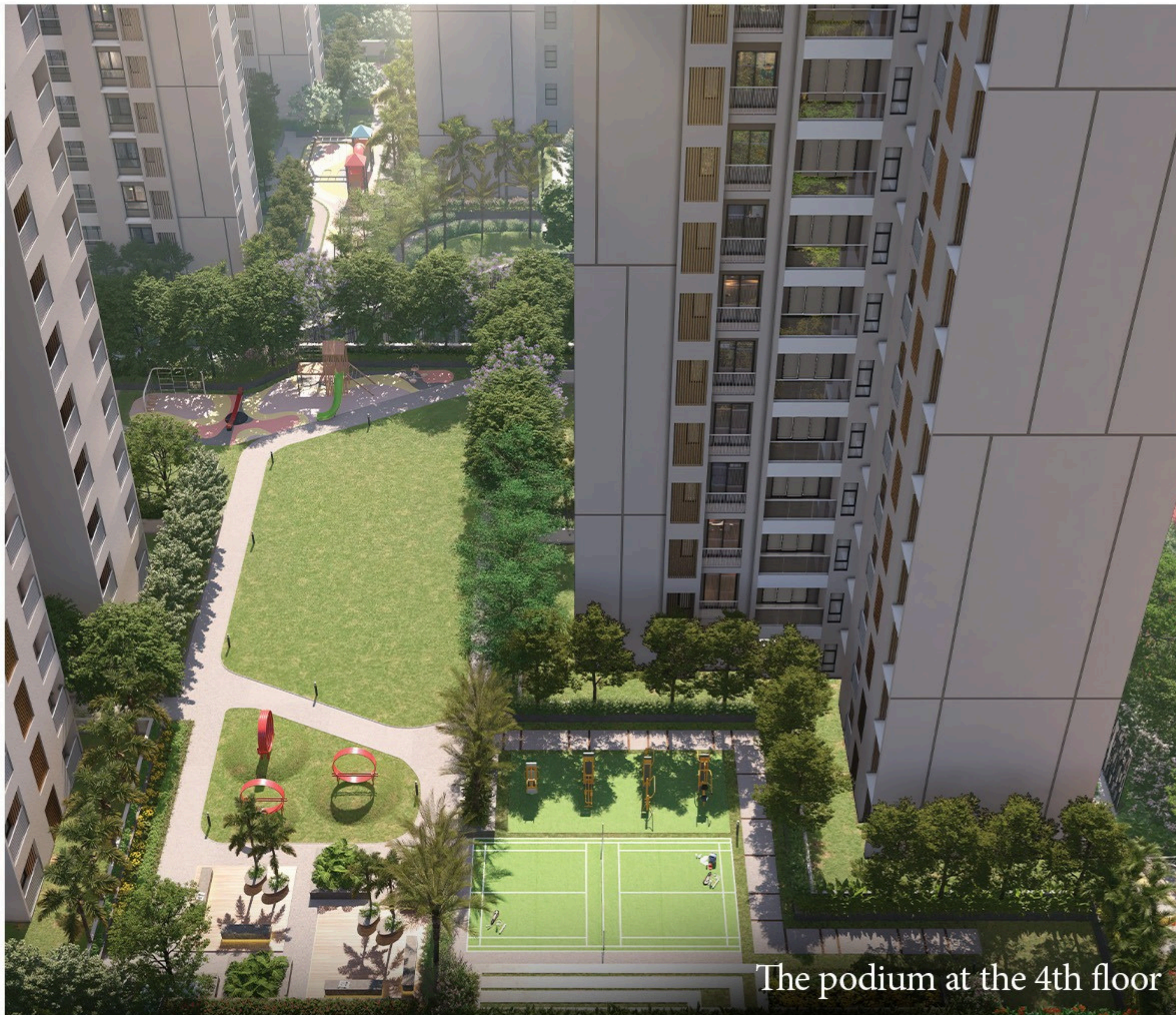
The podium at the 4th floor