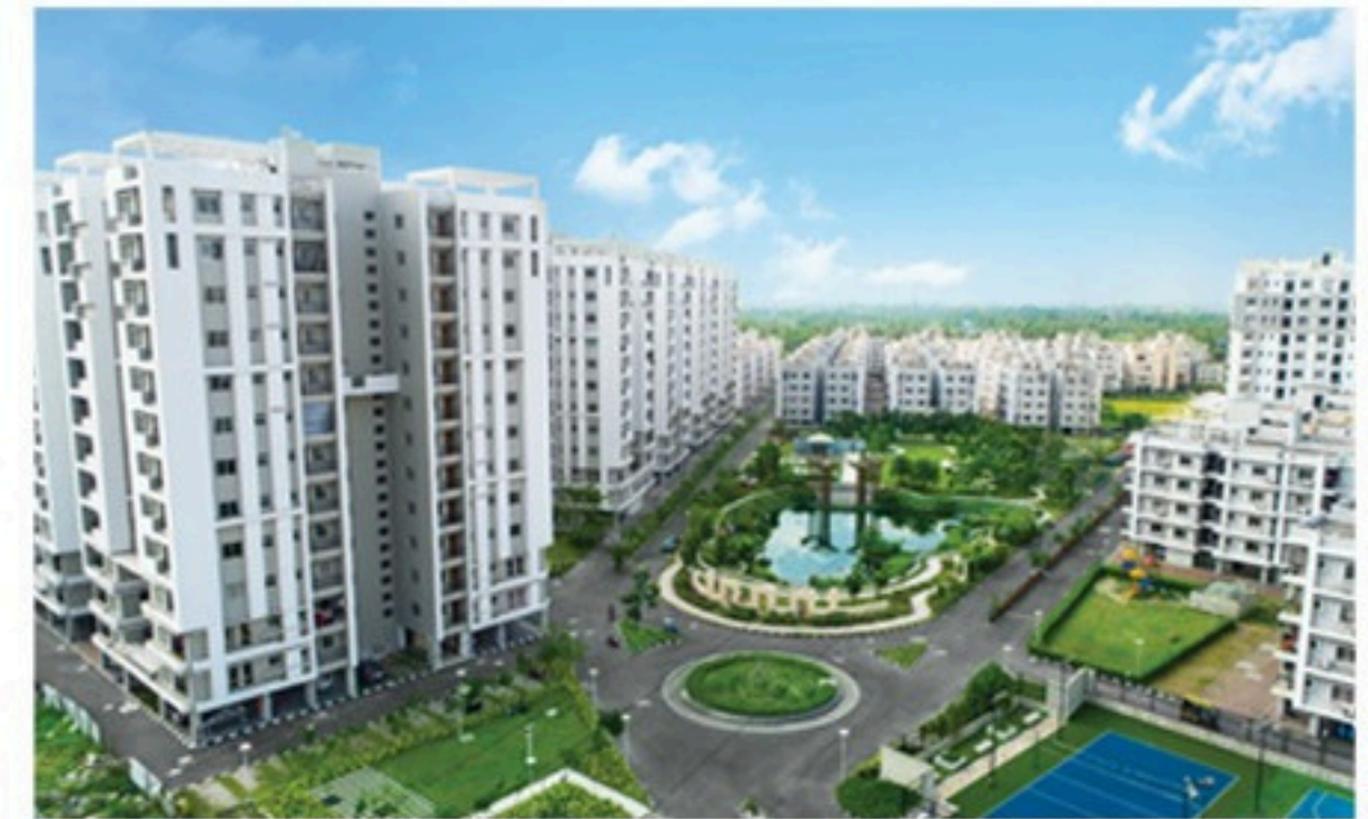
Greenfield City near Behala Chowrasta Metro