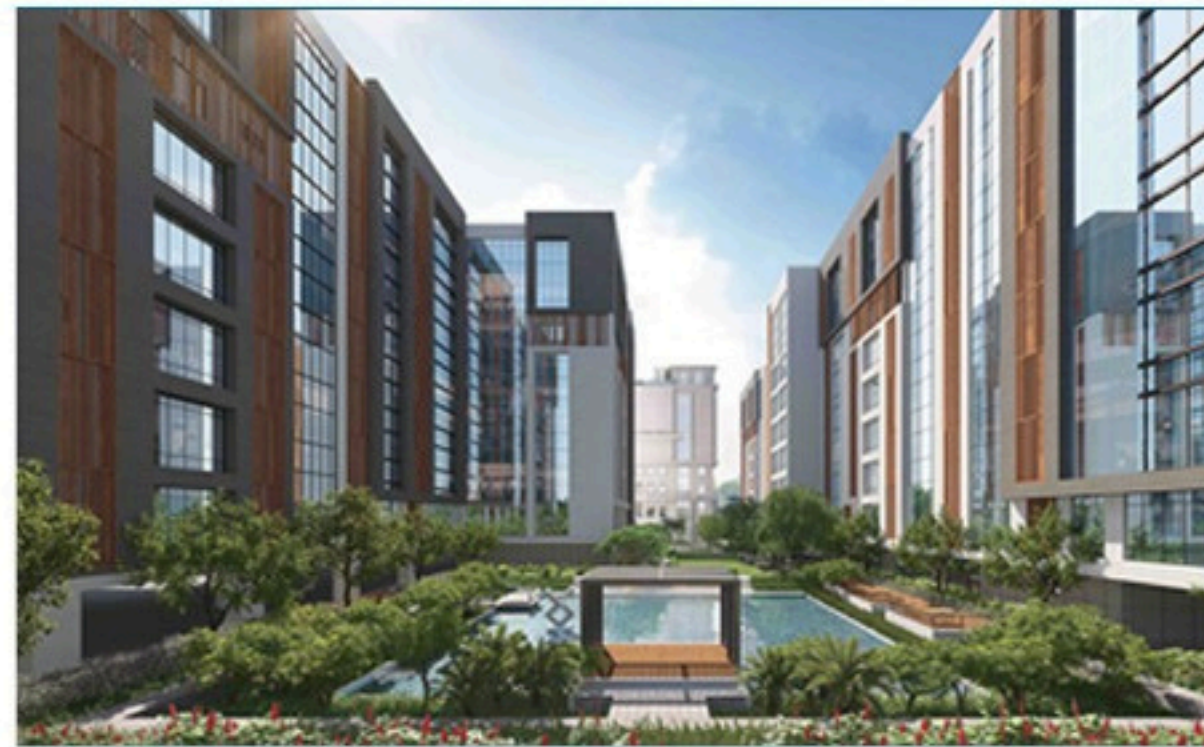
Intellia near Park Street