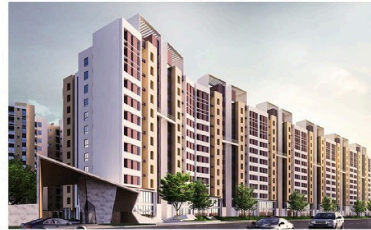
Eternis Jessore Road