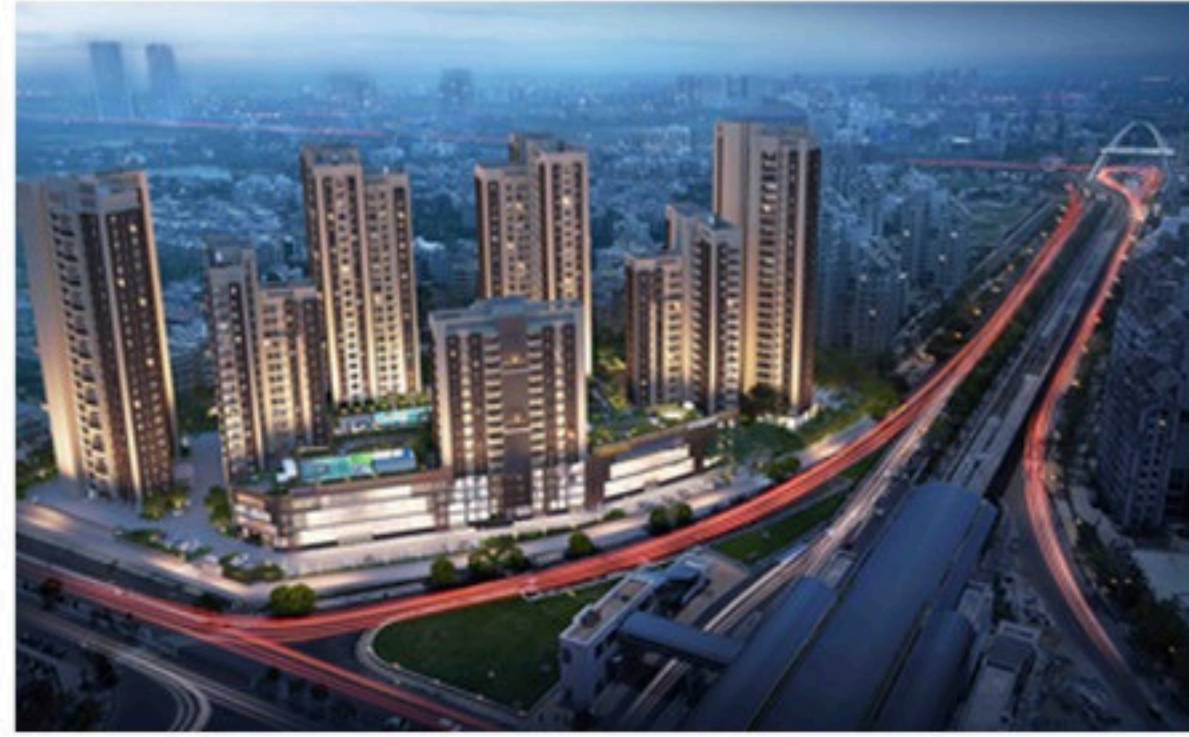
Town Square near Newtown