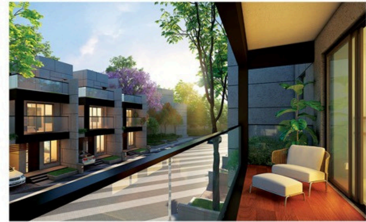
Botanica near Southern Bypass