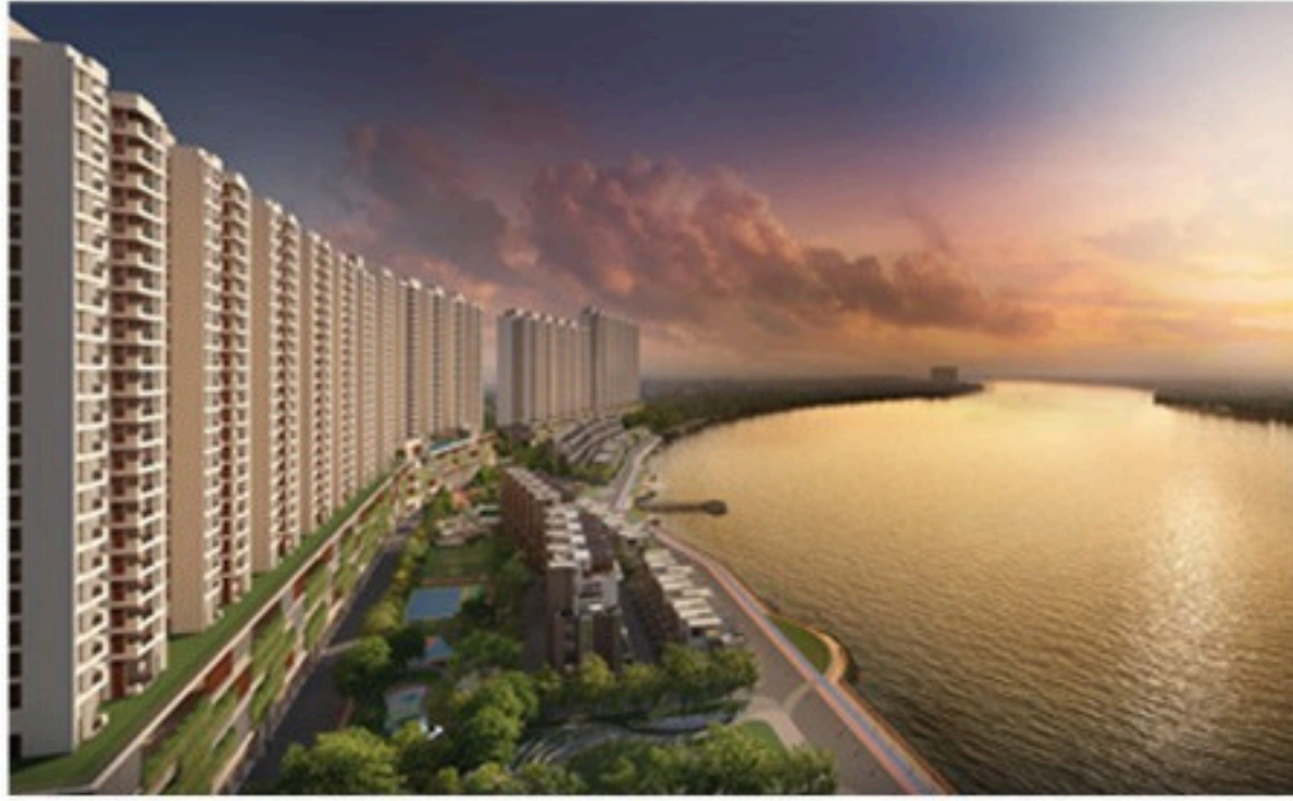
The Royal Ganges Batanagar

Srijan possess a rich track record of 24 ongoing projects of 25 million sqft, 16 upcoming projects of 15 million sqft and 34 completed projects of 12 million sqft.