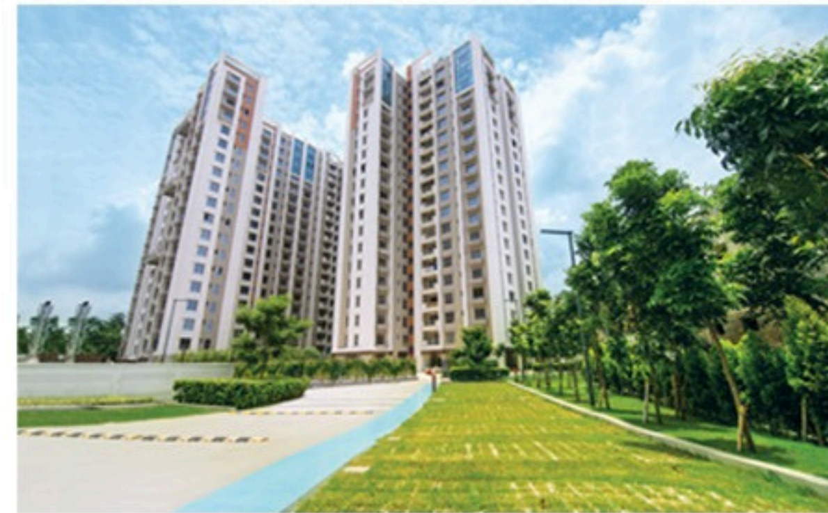
Ozone South EM Bypass