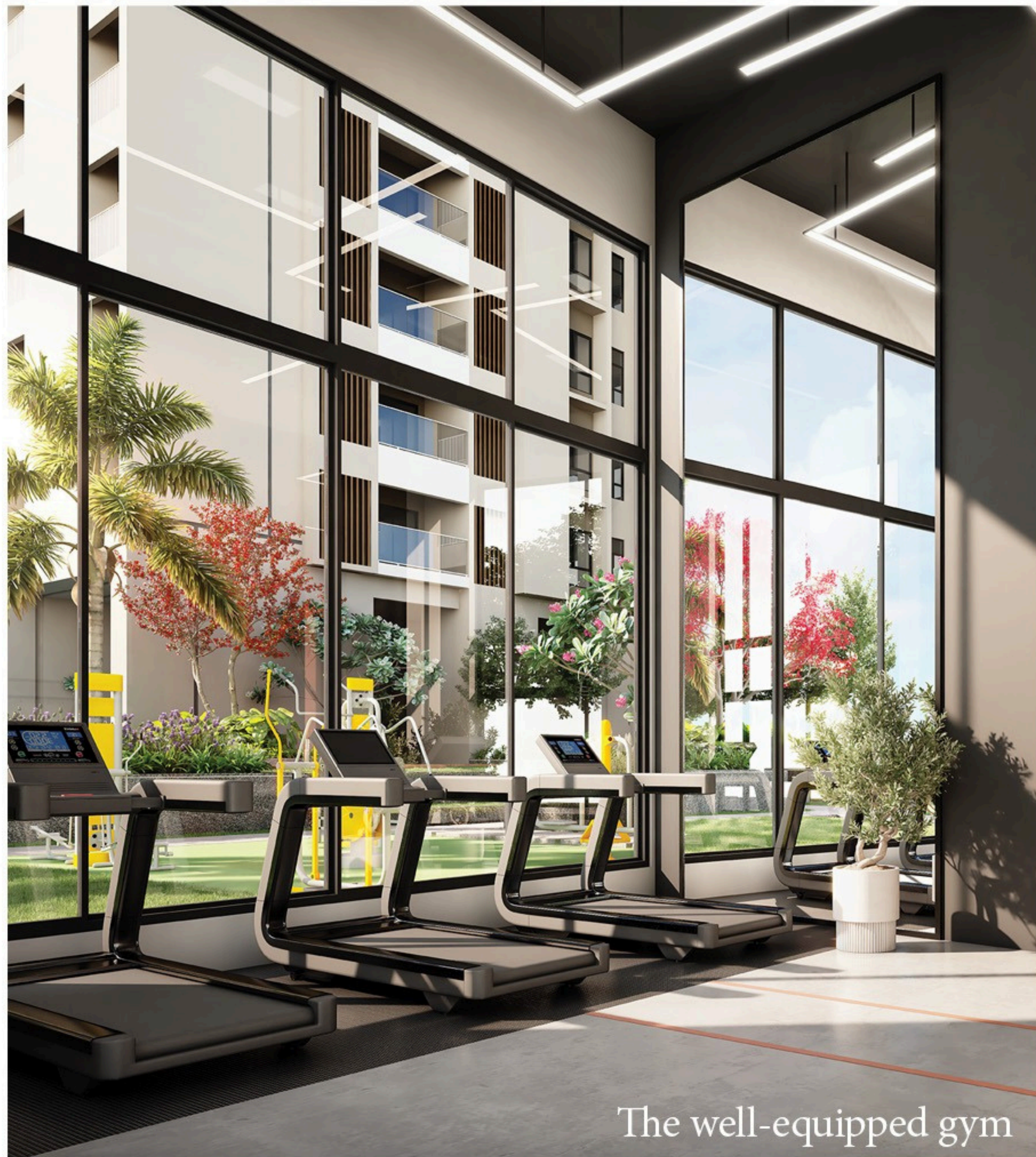
The well-equipped gym