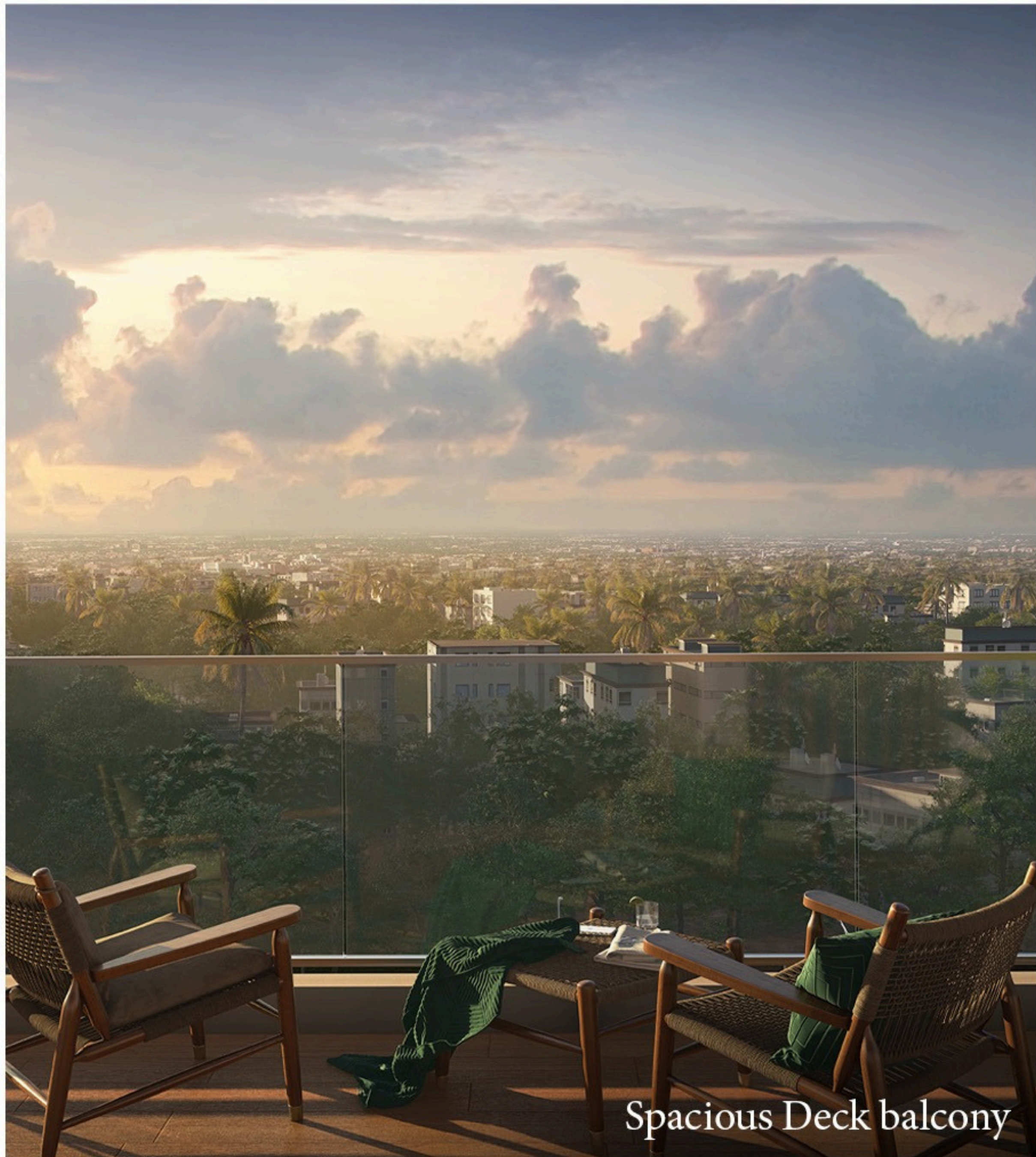
Spacious Deck balcony