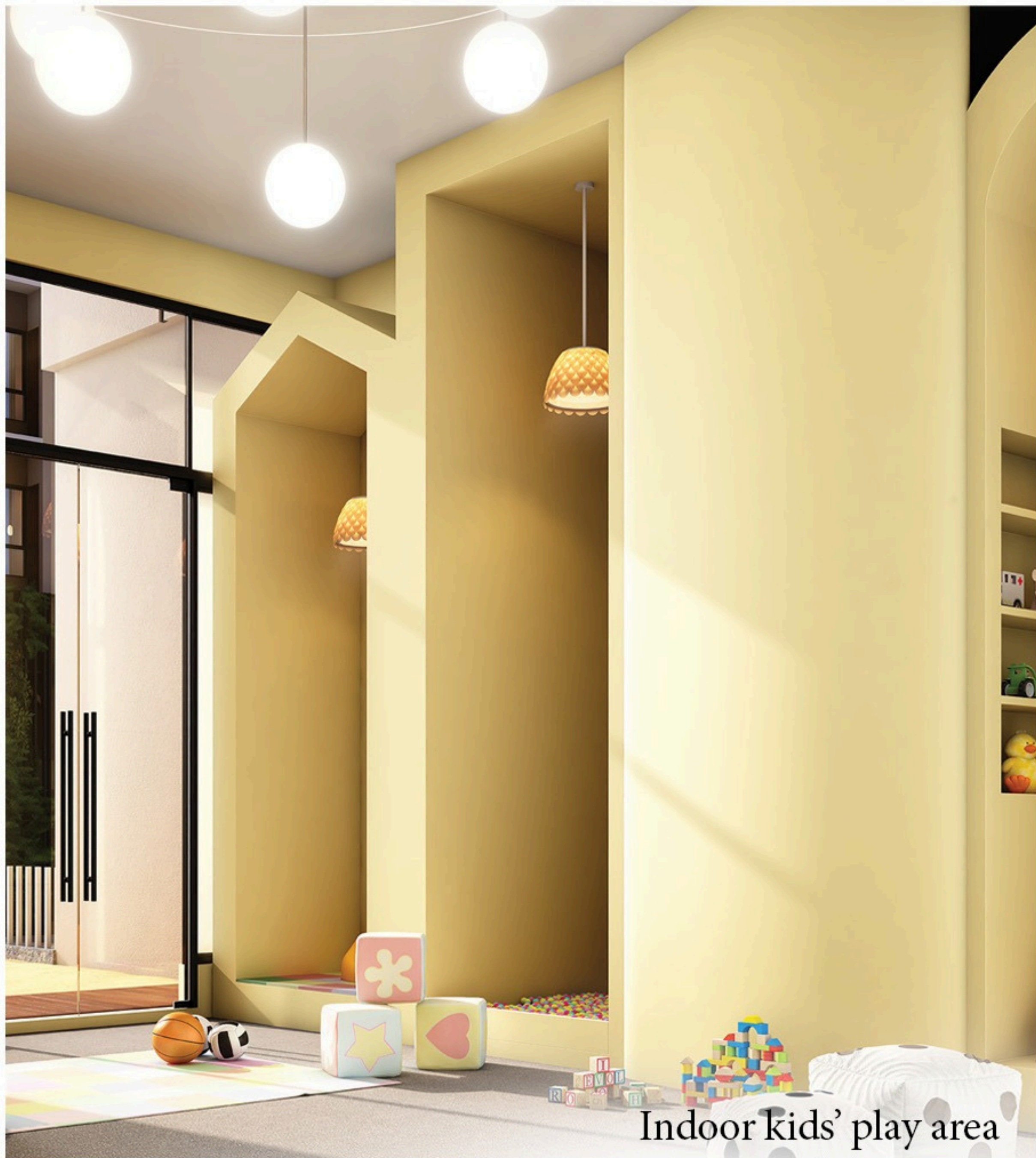
Indoor kids' play area